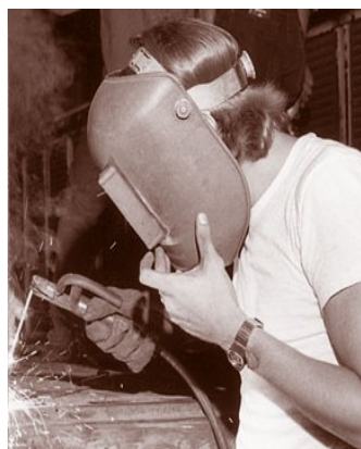
Above: Vocational training became the focus at Willow River Camp in 1972.

If you find these photos and miscellaneous information interesting and would like to read and see more stayed tuned for the next MJPS newsletter. In the meantime if you have any photos or stories of your own please feel free to contact me and I will include your information into the newsletter and you will receive the credit of course. I hope everyone finds this information entertaining and feel free to share with fellow officers or friends that may have at one time or are currently working in corrections.