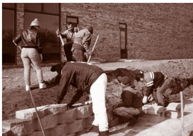
Below: Offender work programs were authorized by legislature in 1967.