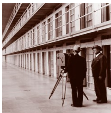
Picture Above: Warden and Deputy Warden demonstrating possible use of cameras for security purposes at the State Prison in 1939.

While searching for information to add to this newsletter I came across a very interesting document on MN Corrections and it's history. Credit must go to the MN Corrections Association which is a non-profit organization formed in 1933. This website link can be located on our MJPS website, if you click on the link; the MCA page will open and on the right-hand side under the 75th Anniversary logo you will find another link to the History of Corrections. I suggest if you have a minute or two to open this link and read all the information pertaining to corrections and probation dating back to 1853. It does focus mainly on the prison system but the information is great. I have also placed some photos in this article that you may find interesting.